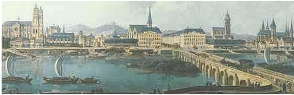
The entrance of Tours in the eighteenth century from the north

Tours is a city with a unique historical past, several times in history it was the main city of France. Since the Roman Empire it was recognized as the capital of the Third Lyonnaise, it was an attractive place for pilgrims in the Middle Ages and was the residence of the kings during the Renaissance . The city subsequently lost its importance when the kings and their court returned to Paris. However, it is in Tours that governments have taken refuge in difficult times, either during the War of 1870 or at the beginning of World War II .