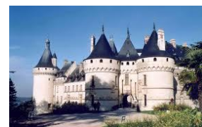
Chaumont Sur Loire