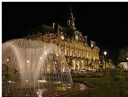
The City Hall

Discover the magnificent cathedral, built from the XII to the XVI centuries.