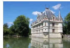
Azay Le Rideau